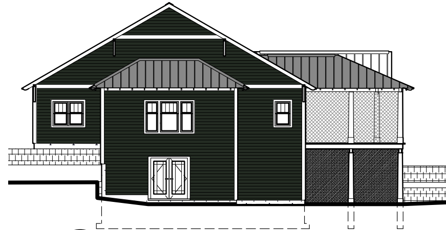
4 COMMON HOUSE EAST ELEVATION A-2.1 Scale: 1/16" = 1'-0"