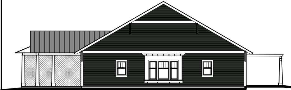
3 COMMON HOUSE WEST ELEVATION A-2.1 Scale: 1/16" = 1'-0"