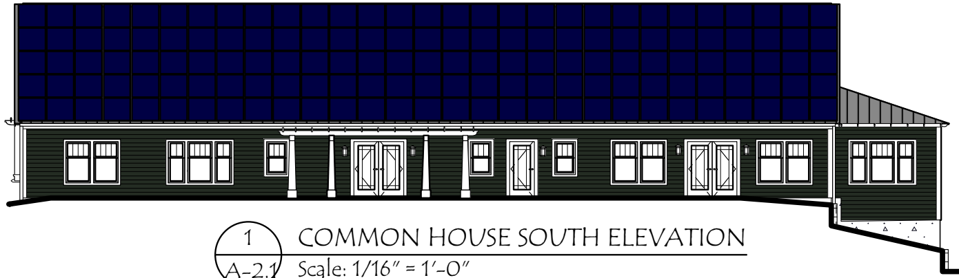
1 COMMON HOUSE SOUTH ELEVATION A-2.1 Scale: 1/16" = 1'-0"