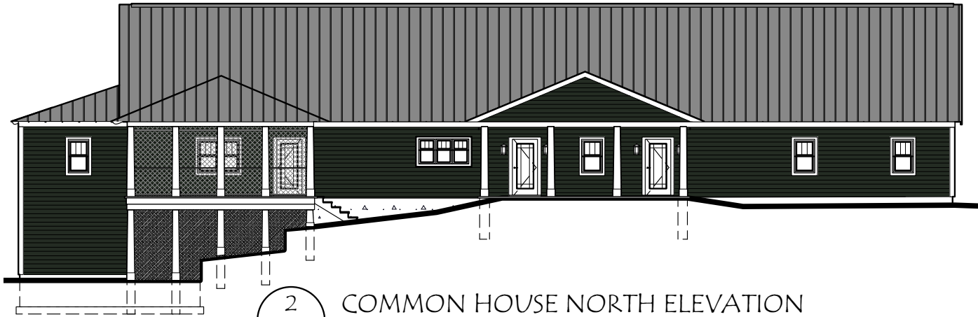
2 COMMON HOUSE NORTH ELEVATION A-2.1 Scale: 1/16" = 1'-0"